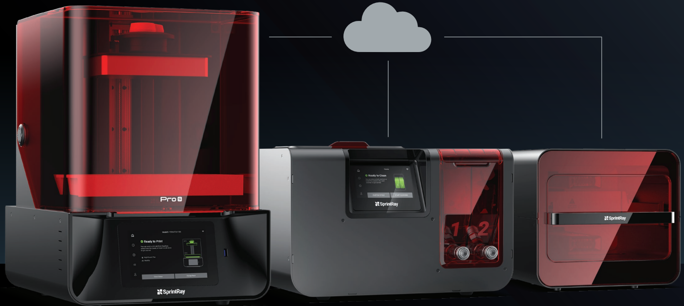
PRO95 S PRINTER

When you start a print job, you're activating a full production ecosystem that monitors progress and keeps track of finishing instructions. With SprintRay Cloud, your devices automatically transfer job information from start to finish. That's frictionless.